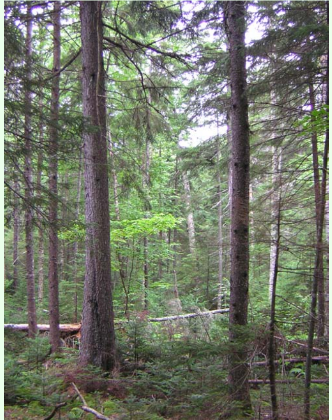
Fig 1. Old-growth upland spruce-fir forest in Maine.

Field Procedure: Run a hip chain (or pace) for 10 chains (~200 m) and count number of large (≥ 16" DBH) trees (alive or dead) and number of trees (alive or dead) with long (≥ 6") Usnea spp. within ¼ of a chain (~5 m) on either side of the transect (a ½ x 10 chain plot [½ acre] or ~ a 10 x 200 m plot [0.2 ha]). Tally up the number of large trees and the number of trees with long Usnea spp. The number of samples required to precisely estimate a stands LS Index will vary depending on how much the LS index varies throughout a stand and stand size. We recommend 1-3 transects per stand. Calculating the LS Index: Use the look-up tables below to derive the large-tree score and the lichen score for your two density numbers. Sum the two scores to get the LS Index. If you chose to sample some other fixed area, you can convert the densities to a per-acre or per-hectare scale, and also use the look-up tables accordingly.